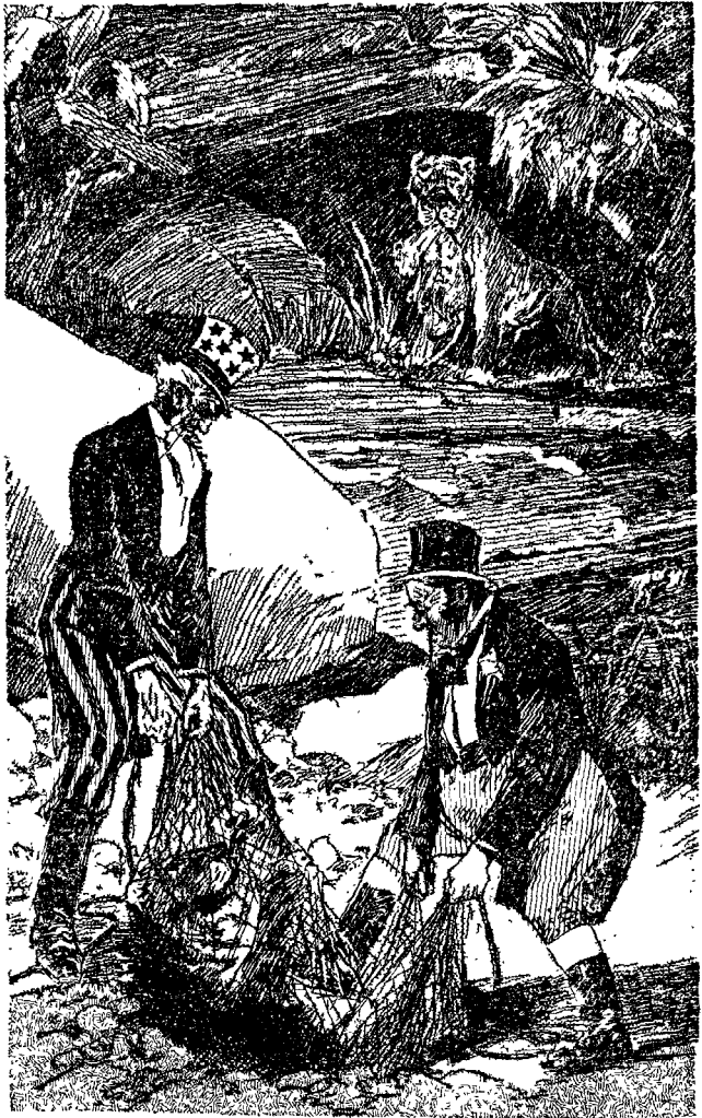
SELECTING THE RULERS